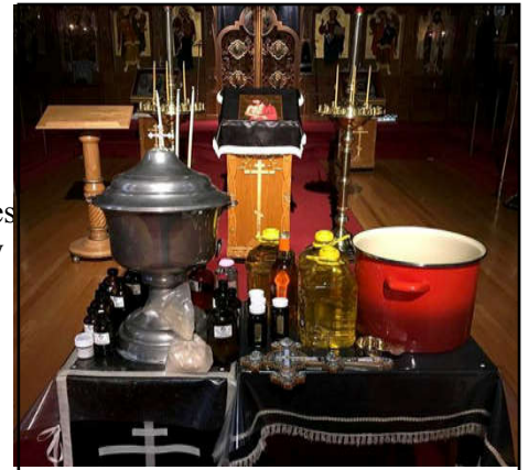
Ingredients for the Chrism are assembled.

A video can be viewed on the OCA web site and Facebook page .