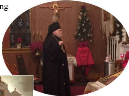
Bishop praying during the Great Vespers