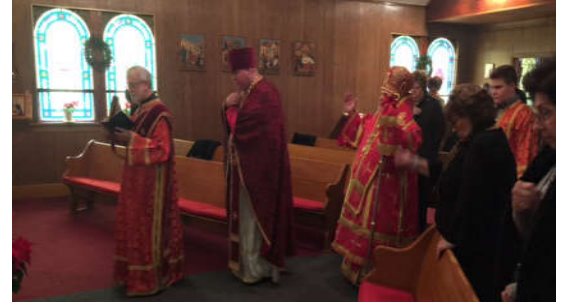
"O Heavenly King, the Comforter, the Spirit of Truth....."