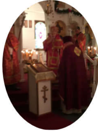
During the Great Entrance at Divine Liturgy