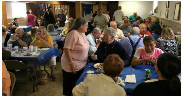
Some of our guests enjoying the Paternal Lamb Roast. Record 147 tickets sold. There were many people outside as well.