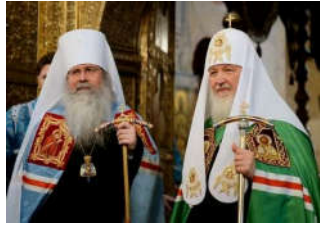
Metropolitan Tikhon with Patriarch Kirill, Moscow, December 2014.

At the invitation of His Holiness, Patriarch Kirill of Moscow, His Beatitude, Metropolitan Tikhon and a delegation from the Orthodox Church in America will join the Primates and representatives of the Local Orthodox Churches at services and related festivities in Moscow marking His Holiness' 70th birthday.