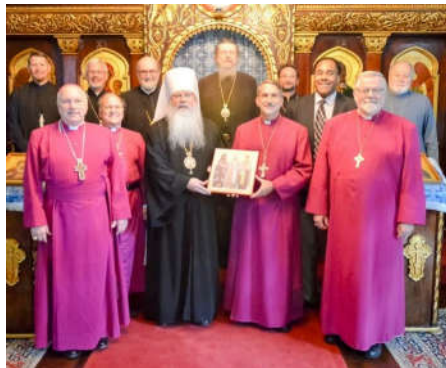
Metropolitan Tikhon welcomes ACNA representatives to OCA Chancery.

With the blessing of His Beatitude, Metropolitan Tikhon, a meeting between the Orthodox Church in America [OCA] and the Anglican Church in North America [ACNA] was held at Immaculate Conception Seminary here on Wednesday and Thursday, August 17-18, 2016.